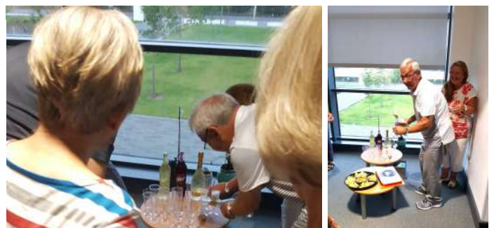
Above and Below: Toasts are given and a choice of savoury biscuits (and the celebratory cake, centre-stage), are ready for LMRC folks and supporters to enjoy at their first gathering in their new meeting place at the Community Use School , Levenmouth Academy.