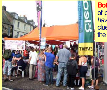
Both Below: The sheer amount of people at the CLEAR Buckhaven and LMRC stall gives a clue how busy and successful the Food & Drink Fest. was.