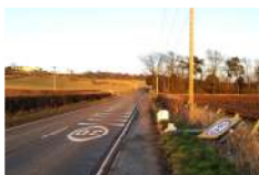
A CIRCA-200-Year-Old Milestone, by the A.917